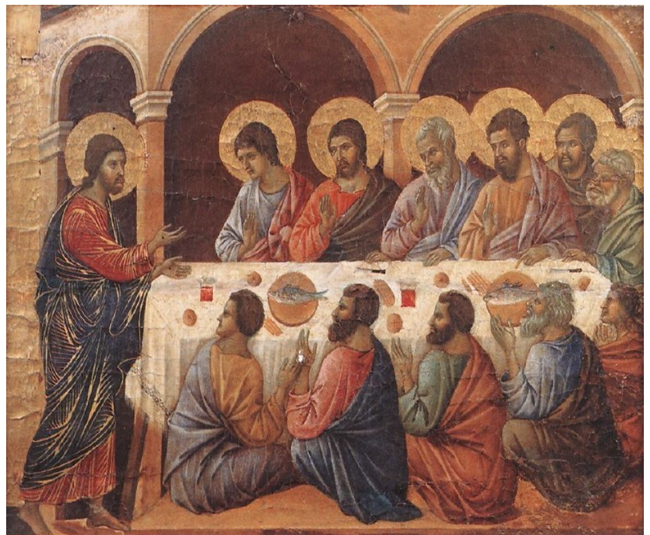
Jesus' Appearance While the Apostles are at Table by Duccio di Buoninsegna (1255-1319)

“Each of us is the result of a thought of God. Each of us is willed. Each of us is loved. Each of us is necessary.”