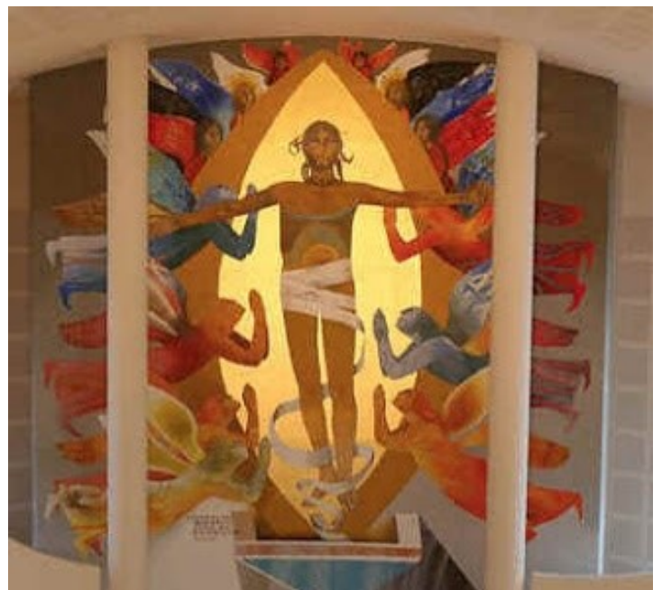
Resurrection. It's on the front wall in St. Paul de Meythet Church in Meythet, a suburb of Annecy, south-eastern France. Painting 1998 - by Arcabas (Jean-Marie Pirot).

The disciples recognized the Lord Jesus in the breaking of the bread, alleluia.